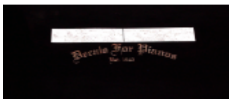
#7. Slowly remove the last piece of tape used to mark the proper location of the decal.