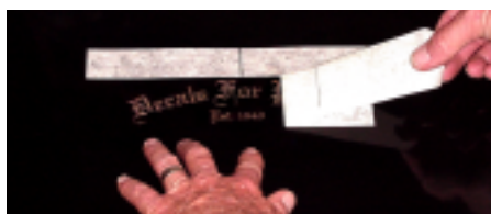
#6. Slowly remove the tape covering the decal. Carefully pull the tape back over itself.