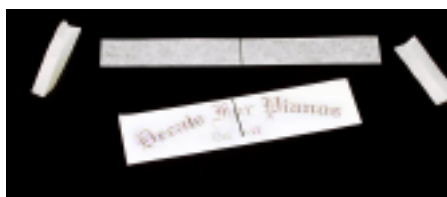
#1. Application materials, note placement tape and decal have centers marked.

You may finish over the decal, if you wish. Carefully spray, one or two, light mist coats of clear finish over the decal. After the mist coats have dried thoroughly, you may apply the finish coat in the usual manner.