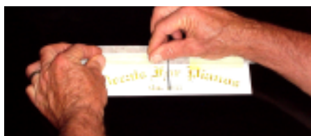
#2. Masking tape at top edge of decal holds the decal in place and acts as a hinge.