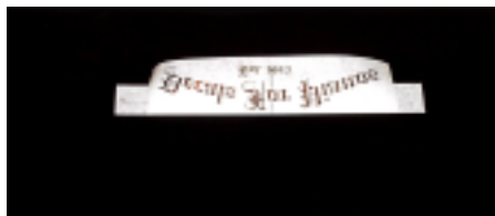
#4. Remove the release liner (backing paper) to expose the back of the decal.